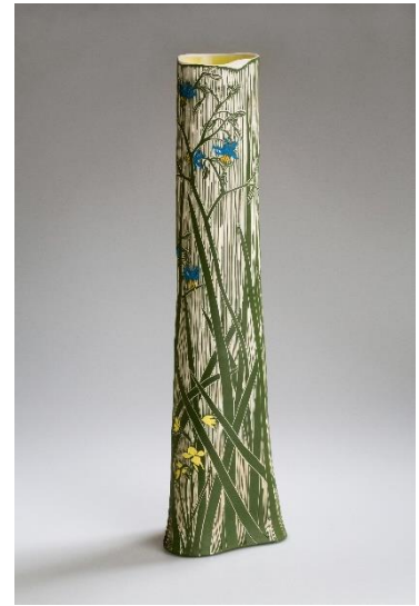
Cathy Franzi - Volcanic Plains: Flax Lily with Orchid