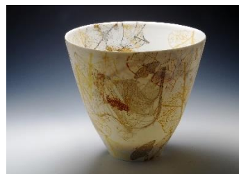
Mollie Bosworth - Fragmentation