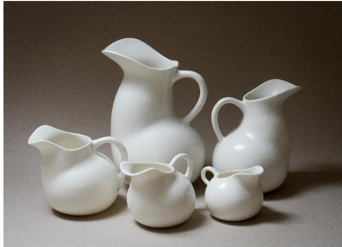
2017 Winner - Vanessa Lucas / Pearl Jugs

Prepared by Creative Clunes Inc. PO Box 287 Clunes Victoria 3370 Australia ABN 43 846 959 541 © Creative Clunes Inc. 2017